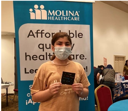
(Above) Additional photos from the vaccine events hosted by Molina, MD Kids Pediatrics, and CVS Pharmacy.